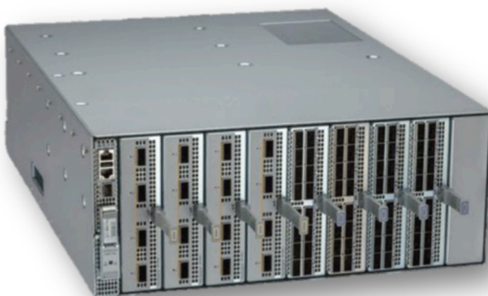
12.8, 25.6 Tbps Switch

The CRT55321 is a low power version of the Credo Bald Eagle and functions as an 800G Retimer or 400G Gearbox. It is suitable for both backplane and front panel applications including cloud-scale switches, high density routing platforms and advanced server NIC cards.