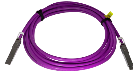
1:1 Direct LP CLOS AEC