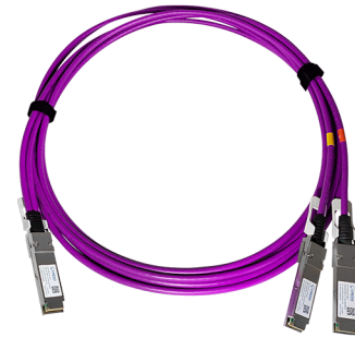
1:2 Breakout LP SHIFT AEC