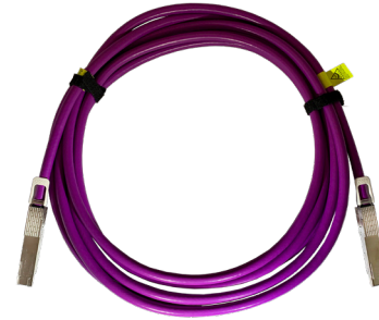
1:1 Direct LP SPAN AEC