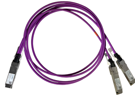
1:2 LP SWITCH AEC