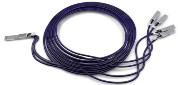
1:4 Breakout SHIFT AEC