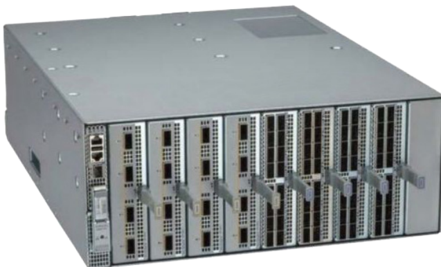
12.8, 25.6 Tbps Switch